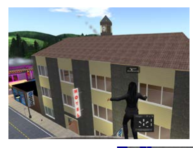
Hotel on the iPortal