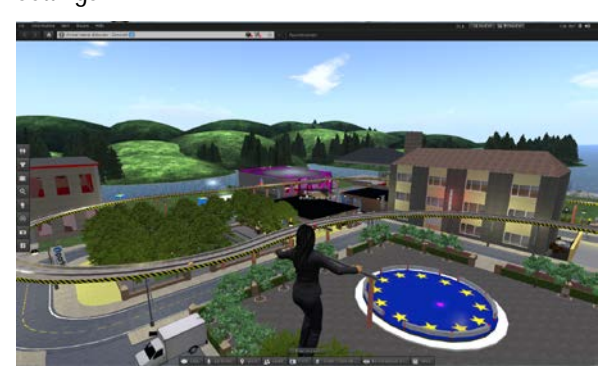
iPortal island in Second Life

The iPortal island in Second Life is very useful for the communication part of a language course. Before getting to the session in Second Life, the reading, writing and listening parts can be taught using the iPortal platform and the virtual classroom. On the iPortal island the students are able to improve their communication skills through role plays in different settings.