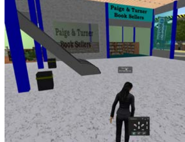
Bookshop on the iPortal island