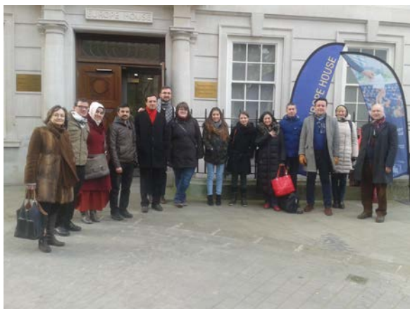
The project team at the 5 th partner meeting

We were very grateful to our UK partner, edEducation for the excellent organization of the meeting.