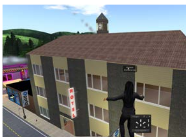
Hotel on the iPortal island