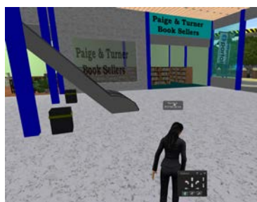
Bookshop on the iPortal island