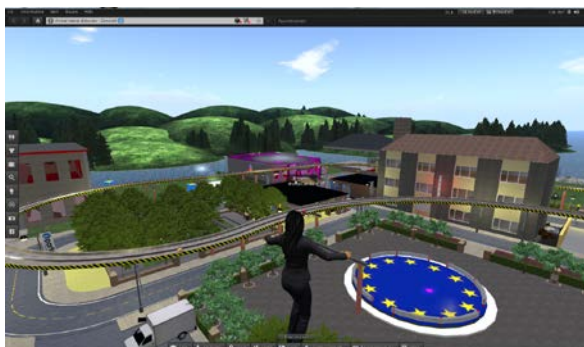
iPortal island in Second Life

The iPortal island in Second Life is very useful for the communication part of a language course. Before getting to the session in Second Life, the reading, writing and listening parts can be taught using the iPortal platform and the virtual classroom. On the iPortal island the students are able to improve their communication skills through role plays in different settings.